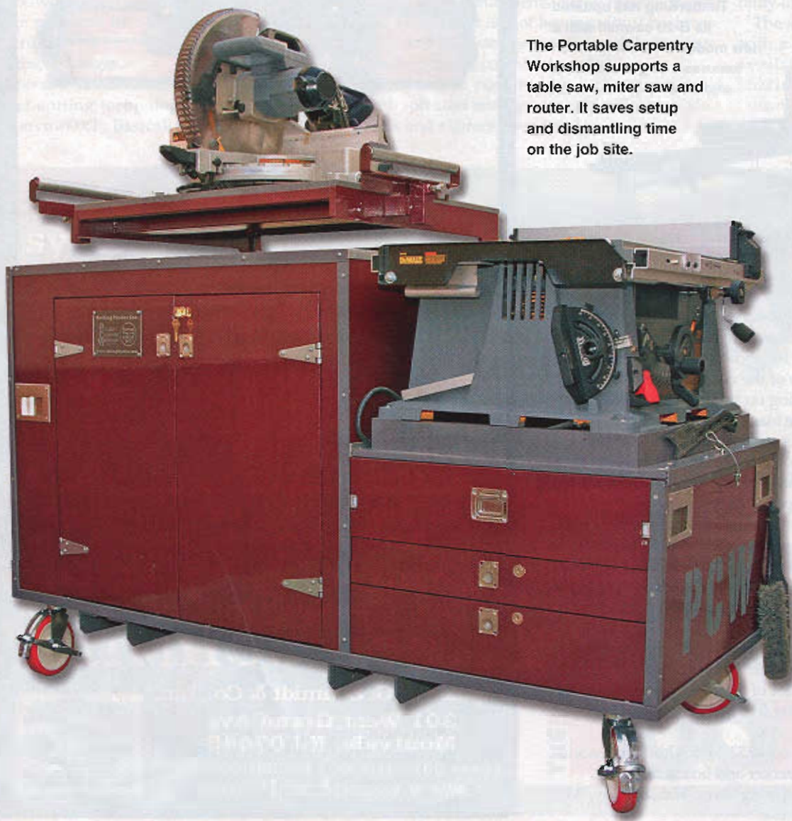
The Portable Carpentry Workshop supports a table saw, miter saw and router. It saves setup and dismantling time on the job site.

Contact: Rolling Trades Inc., 149 79th St., Brooklyn, NY 11209. Tel: 718-576-1559. www.rollingtrades.com